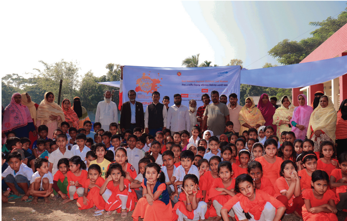
MoWCA, MoYS, and UNICEF Celebrating of the 16-days activism against GBV