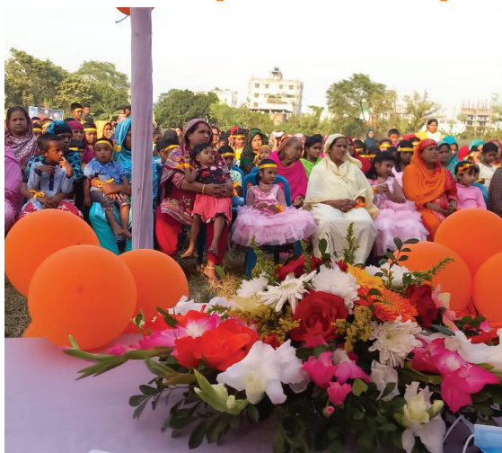
Celebration of the 16-Days of Activism against GBV at Mirpur-12, Dhaka