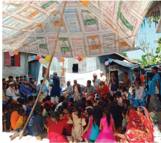
Awareness raising event, the 16-days activism against GBV