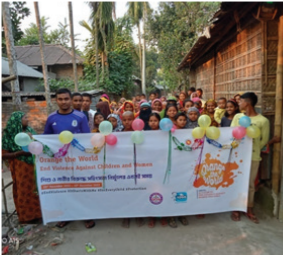
Awareness raising rally, part of 16-Days of Activism against GBV