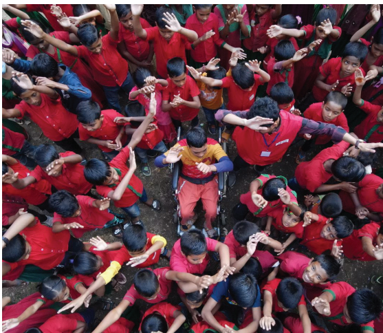
Celebration of the 16-day activism against GBV at primary school, Sylhet