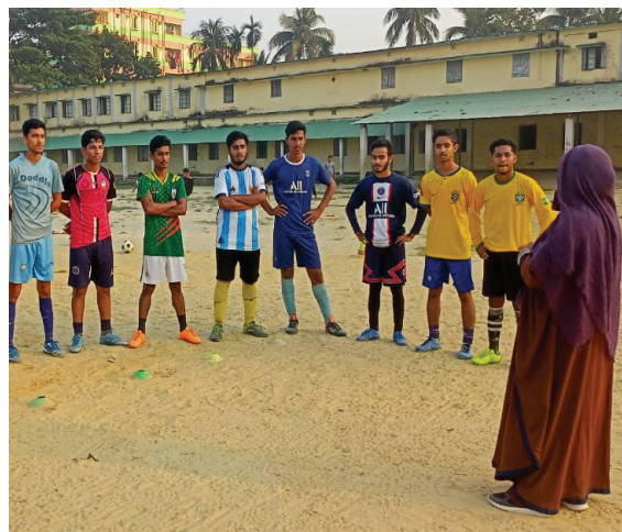
Football game, S4D, part of 16-Days of Activism against GBV