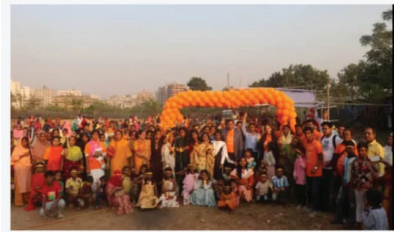
শিশু ও নারীর বিরুদ্ধে সহিংসতা বন্ধে