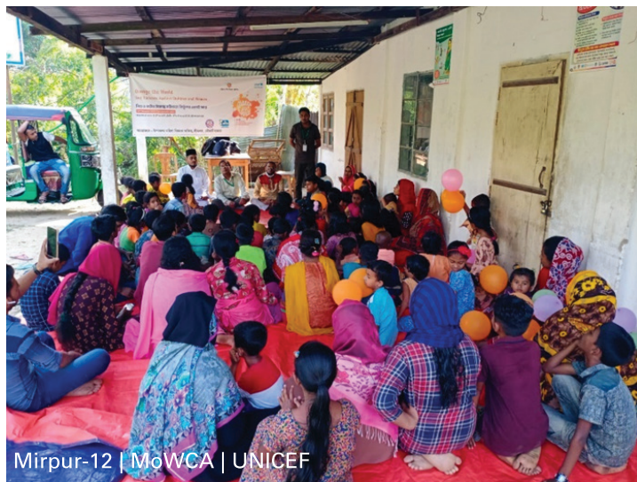
Awareness raising event, the 16-days activism against GBV