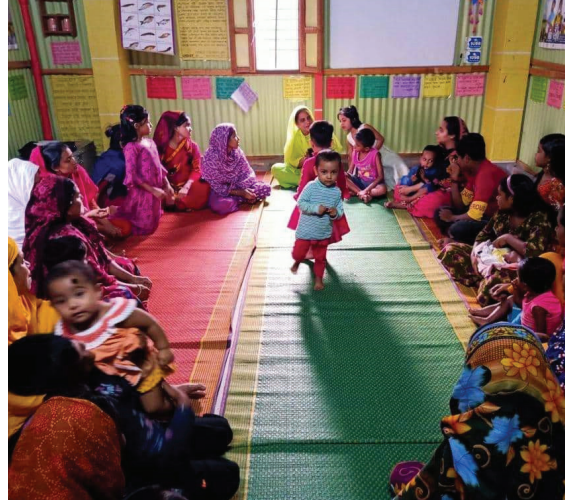
Awareness raising session, part of 16-Days of Activism against GBV at APC CAC