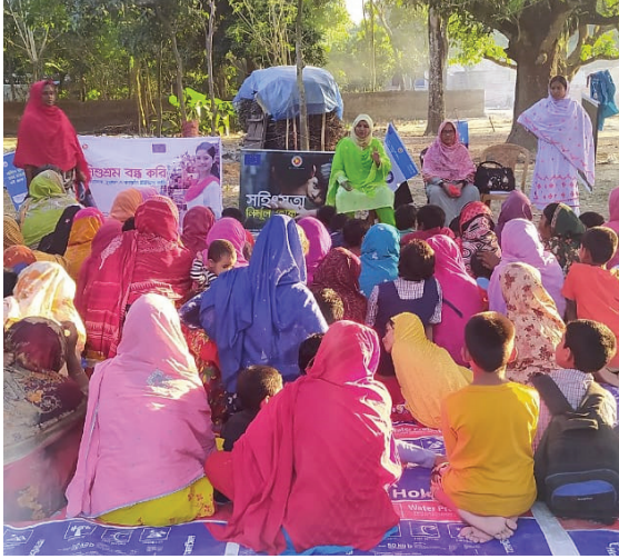
Awareness raising session, part of 16-Days of Activism against GBV at Community