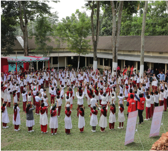
Celebration of the 16-day activism against GBV