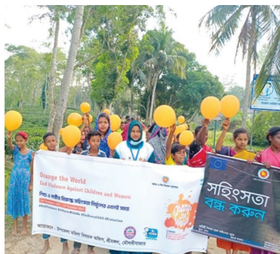
Awareness raising rally, part of 16-Days of Activism against GBV