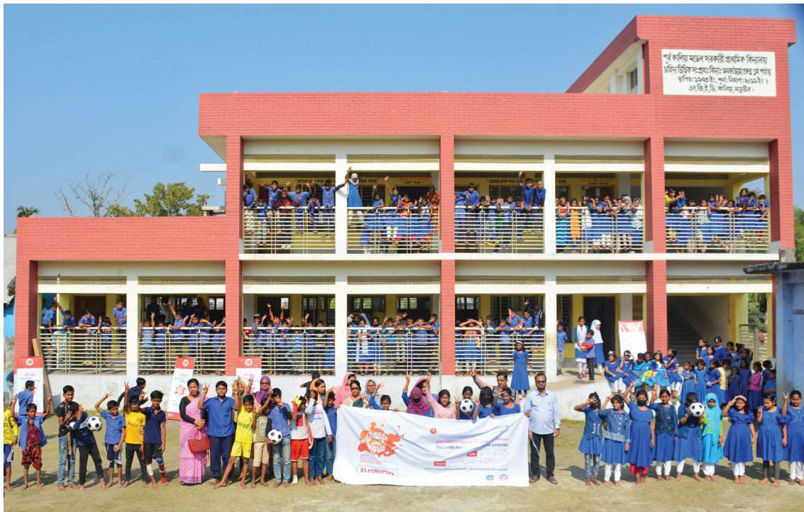
MoWCA, MoYS, and UNICEF Celebrating of the 16 Days activism against GBV at primary school, Kalia, Narail