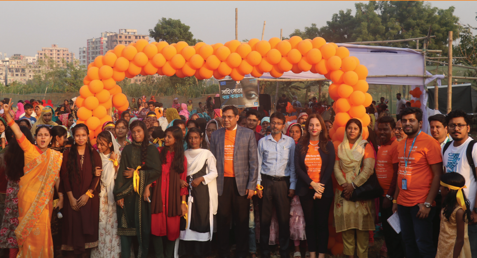
MoWCA and UNICEF celebrating the 16-Days of Activism against GBV at Mirpur-12, Dhaka

“UNITE! Activism to end violence against women and girls”