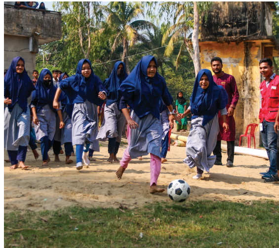
Matarbari Ideal High School, Cox's Bazar